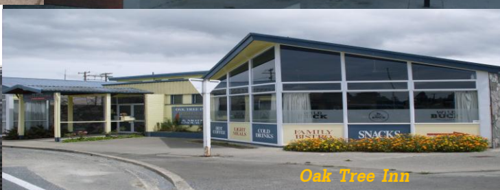
Oak Tree Inn