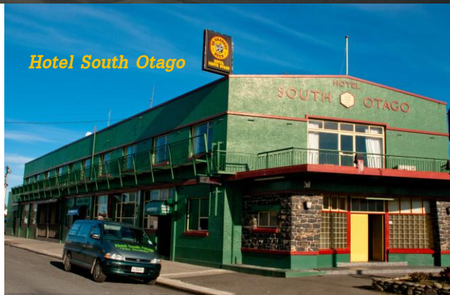
Hotel South Otago