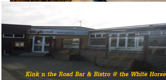
Kink n the Road Bar & Bistro @ the White Horse Inn